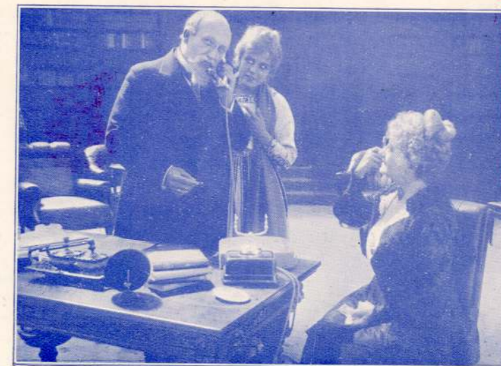
The Carr family at home.

A further survey of Mother Earth discloses . . . the Carr family at home. They have just received a note expressing regret that an old friend of the family cannot accompany them to a ball. Nina Carr suggests that handsome Jack Darnley, their young neighbour, might consent to make up the number. Jack is very much in love with the winsome Nina, and eagerly accepts the invitation. Alone in his room, he bemoans the fact that he has no decent