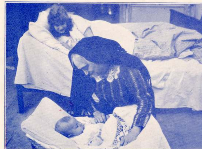
Happiness—in spite of the loss of the magic galoshes.

The old fellow staggers to his feet and sets out for home unconsciously leaving the magic galoshes in the gutter. They find their way into a sale room, where they are bought cheaply by Mrs. Hen-